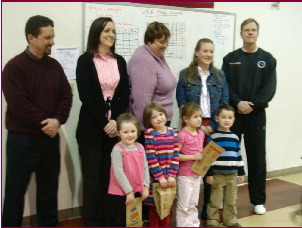
Preschool Character Trait Winners with Board of Directors