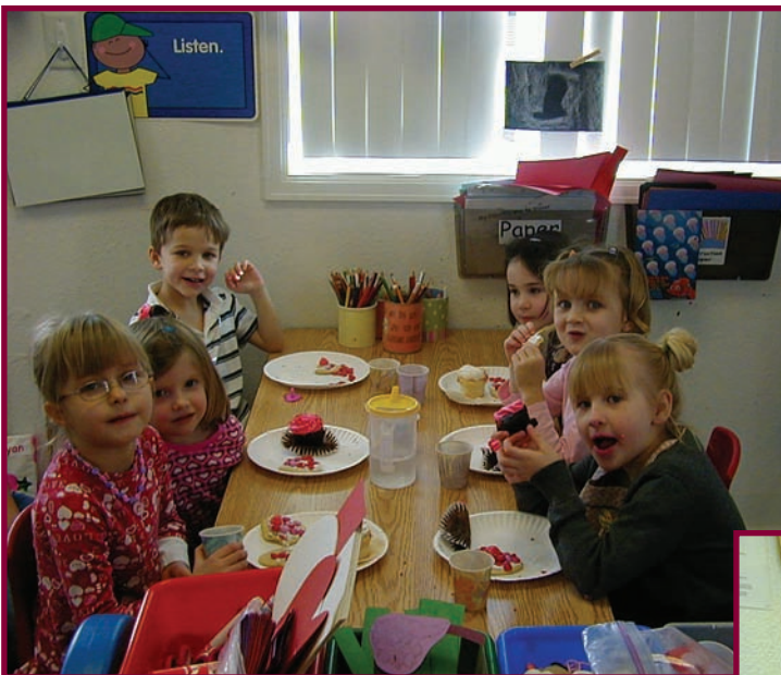
Valentine Day Fun